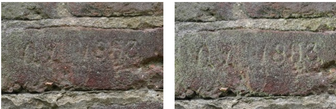
Figure 2: Date graffiti imaged under ambient light (left) and raking light (right).

The benefits of raking light conditions are more obvious in the example of poor condition graffiti (Fig. 2). The central two digits of the year were not discernible by the naked eye nor the photograph taken under ambient light. However under raking light, although the contrast isn't as good as in the previous example, it is clear that the year reads "1883". It should be noted that the direction of raking light had to be optimised in this case, with the graffiti eventually being recorded with raking light below and to the left. In some cases it may be envisioned that several images may need to be taken with raking light coming from different directions in order to elucidate the full piece of graffiti.