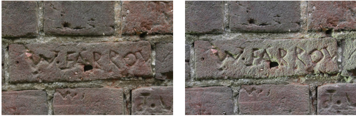
Figure 1: W. Farrow graffiti imaged under ambient light (left) and raking light (right).

The benefits of raking light conditions are more obvious in the example of poor condition graffiti (Fig. 2). The central two digits of the year were not discernible by the naked eye nor the photograph taken under ambient light. However under raking light, although the contrast isn't as good as in the previous example, it is clear that the year reads "1883". It should be noted that the direction of raking light had to be optimised in this case, with the graffiti eventually being recorded with raking light below and to the left. In some cases it may be envisioned that several images may need to be taken with raking light coming from different directions in order to elucidate the full piece of graffiti.