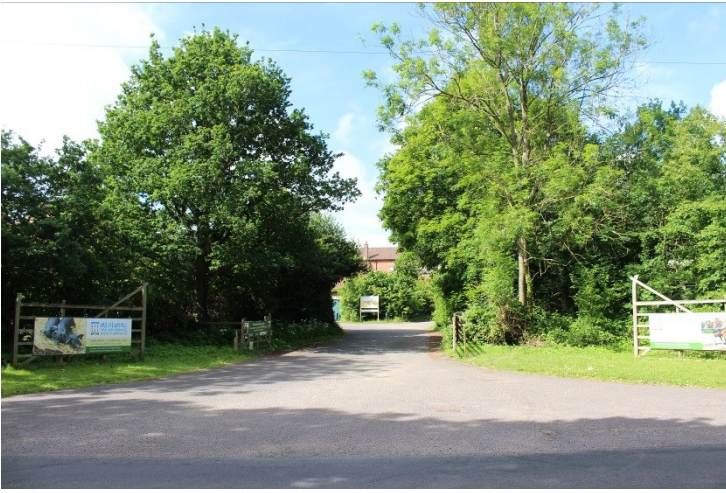
Entrance to Car Park.