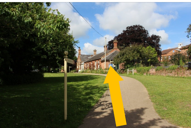
Continue up the path following the main entrance sign.