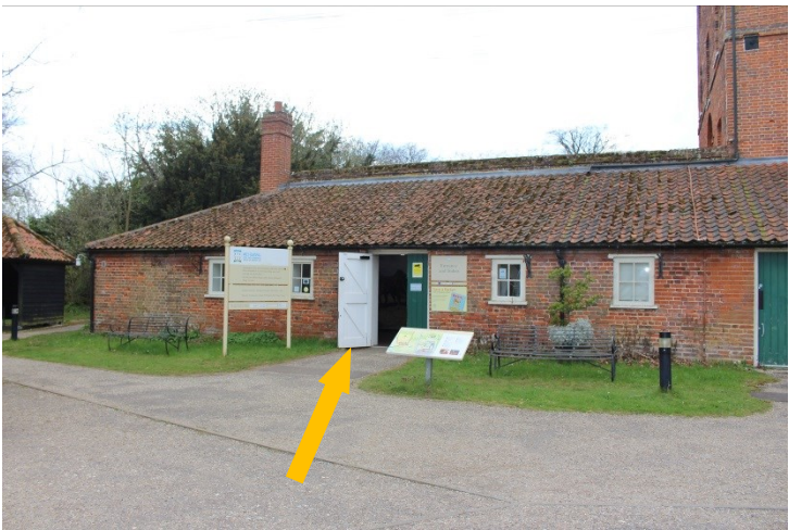
This is the welcome area. There are toilets in here. Go in here and out the other side through another door.